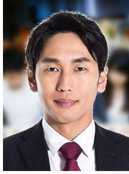
✗ Background clutter