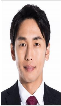
✗ Height × width ratio incorrect