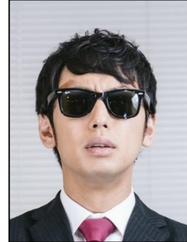
✗ Wearing sunglasses