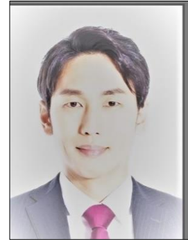
✗ Photo of another photo