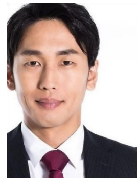
✗ Part of your face not included