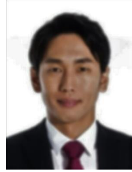
✗ Face is unclear