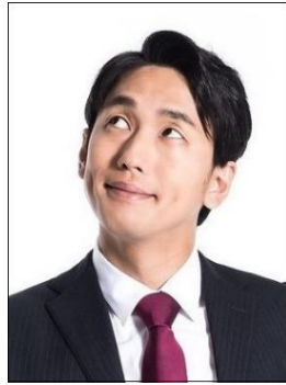
✗ Not looking straight ahead