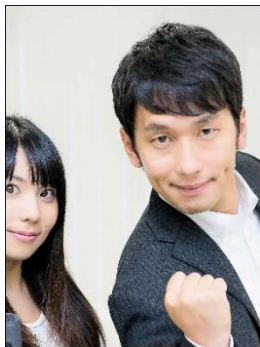
✗ Pictured with someone else